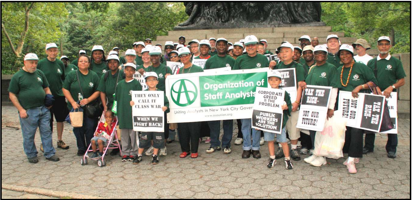
OSA members after the 2011 Labor Day Parade, holding signs that read "They Only Call It Class War When We Fight Back" and "Tax the Rich, Not Our Future!"

We all wish we lived in a world where right, truth and justice prevailed automatically, with no need for our involvement save to do a good job at work. Sadly it is not so.